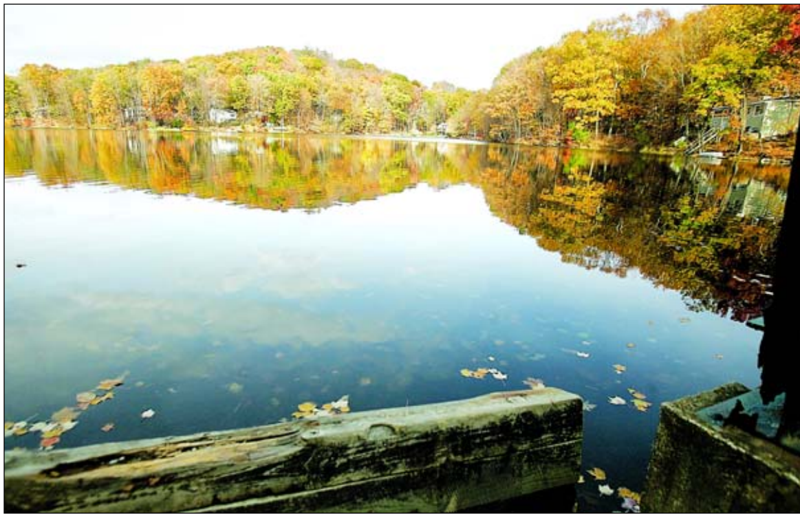
Water flows toward the Lake Neepaulin dam.

The Associated Press contributed to this story.